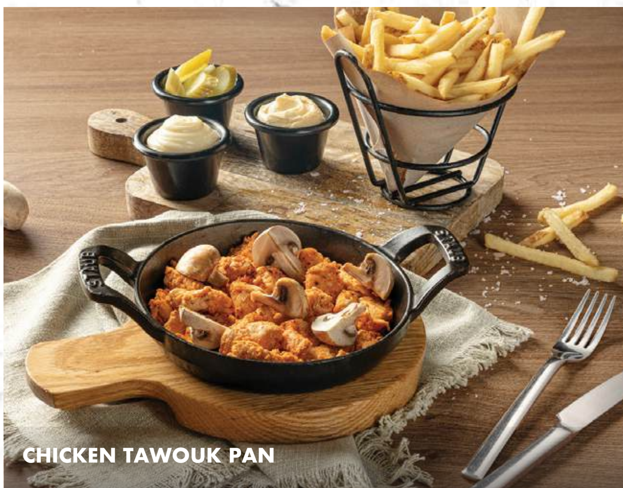
CHICKEN TAWOUK PAN

Marinated grilled chicken breast. Served with thin-cut fries, crunchy pickles, garlic sauce, and our homemade hummus dip