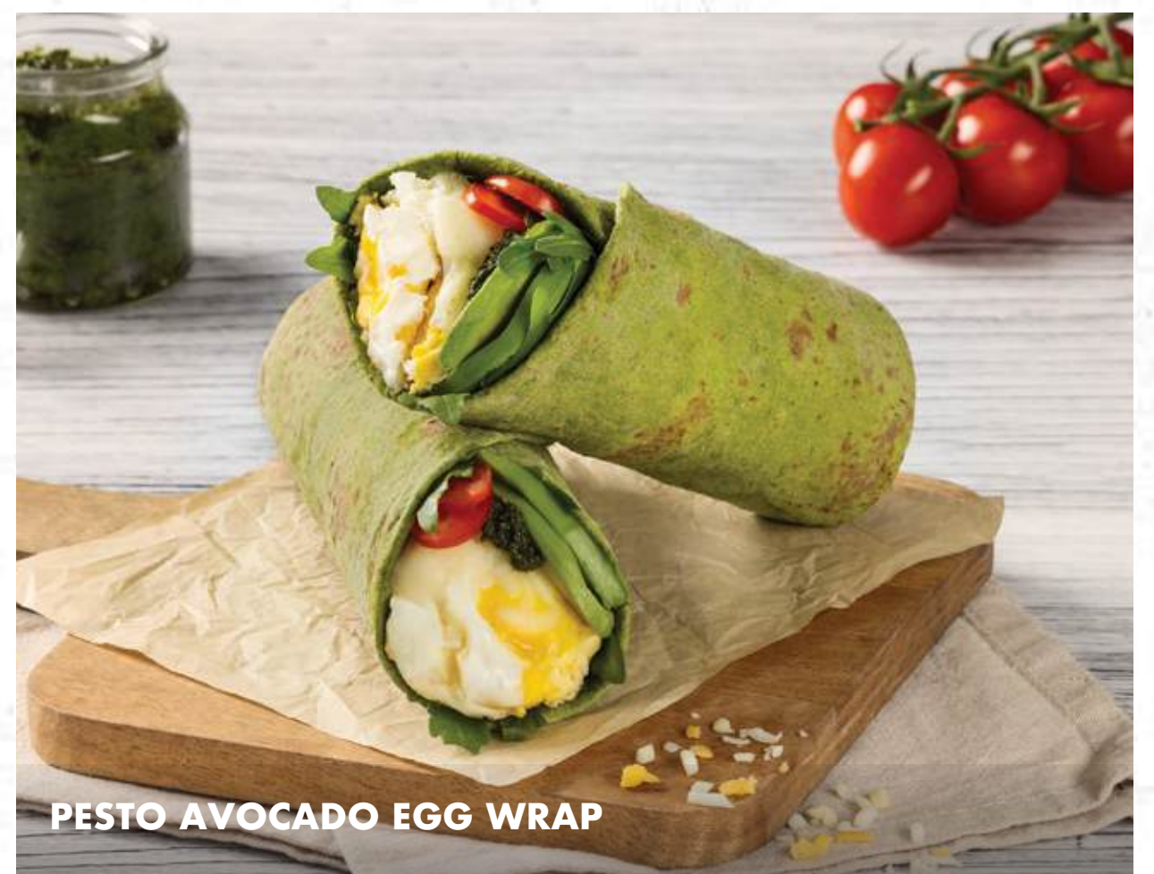
PESTO AVOCADO EGG WRAP

Juicy chicken breast grilled to perfection mixed with fresh mushrooms. Served with thin-cut fries, crunchy pickles, garlic sauce and our homemade hummus dip