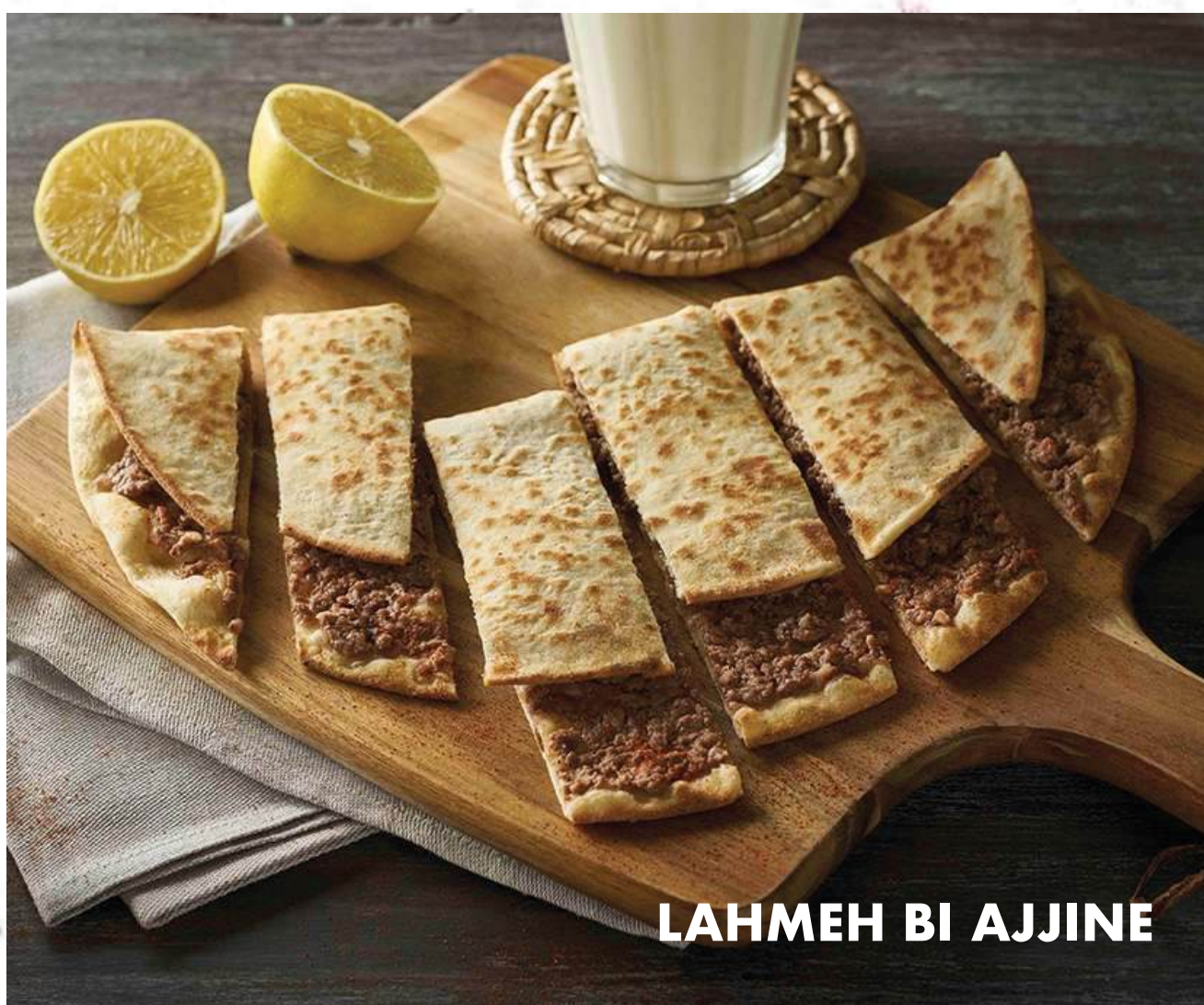
LAHMEH BI AJJINE

Our classic zaatar with fresh mint leaves, tomato, cucumber & black olives